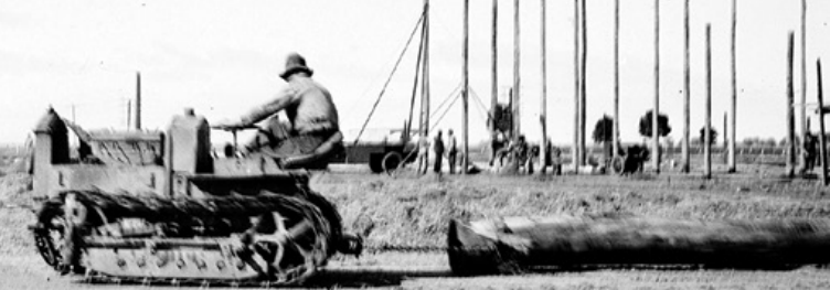
Moving and erecting poles for The Stick Shed, 1941

The Murtoa No.1 Grain Store is an impressive and unusual example of Australian rural architecture; a form of design and construction rooted in the Australian traditions of bush ingenuity and the adaptation of traditional building techniques and materials. The corrugated iron and timber woolsheds across the Australian landscape are the most iconic depiction of this style of building.