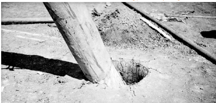
Erecting pole directly into ground, 1941

The Murtoa No.1 Grain Store was in use until 1989.